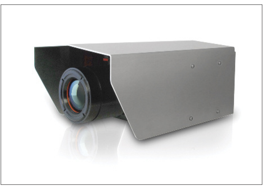
Figure 4. The Vayu HD with environmental housing.

lutions with very advanced features (Figure 2 - Video still from Vayu HD of San Diego's trolley tracks and convention center).