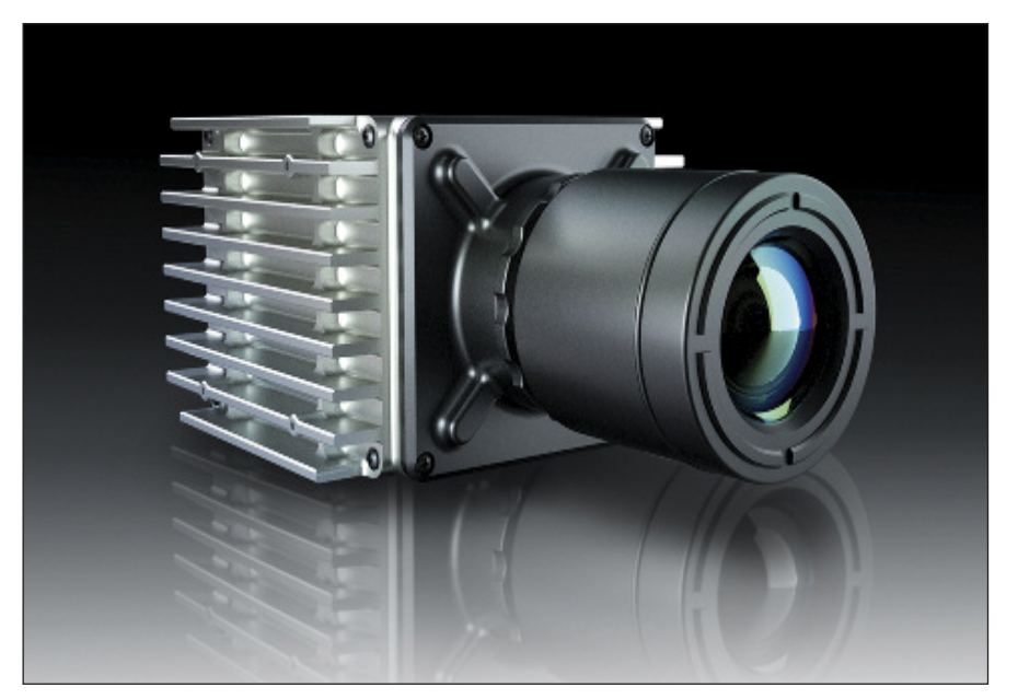
Figure 3. Sierra-Olympic's high-definition thermal 1080p LWIR imager, the Vayu HD..

Small pixel, uncooled microbolometer FPAs for "performance applications", that is, VGA resolution of 640 \times 480 or higher, are still not common. There are small pixel VGA devices available, as well as very high-resolution sensors. As an industry, however, small pixel VGA is still in early development. There are not many small pixel optics available, and there are very few small pixel cameras available for purchase with standard video interfaces. The only VGA resolution, or higher, uncooled microbolometer cameras available are end-user items, such as rifle scopes and commercial cameras with 1920 \times 1200 \times 12 \ \mu m reso-