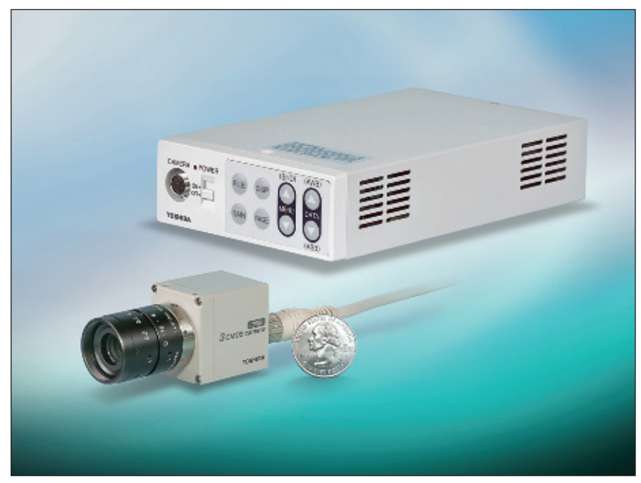
Figure 2. Toshiba Imaging's IK-HD5 3CMOS 1080p HD Video Camera.

While pixel density is a valuable attribute which can contribute to increased resolution, the pixel size will actually have greater influence on dynamic range, sensitivity and noise, especially in low-light situations. All things being equal, larger pixel size equals greater signal and improved video performance. Most camera manufacturers don't disclose pixel size but a reasonable estimate can be calculated if you know the sensor size and pixel matrix.